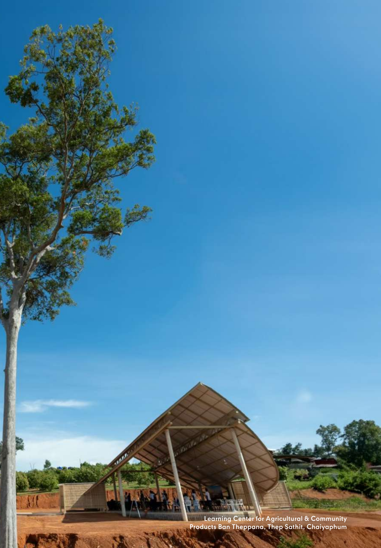
Learning Center for Agricultural & Community Products Ban Theppana, Thep Sathit, Chaiyaphum